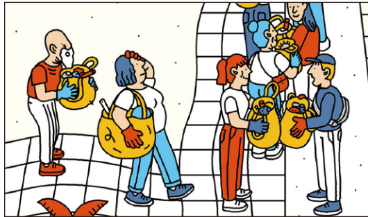
Connection with the community

As of March 2022, there are 80 regional partners within the 25 municipalities in Okinawa Prefecture. We will select an appropriate partner according to your request and organize a beach cleanup activity.