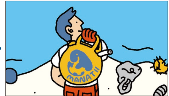
Applied to CSR and PR

By giving lectures on the environment in advance, beach cleanup activities can be more educational. Similar programs can also be arranged to be conducted in the city instead of the beach.